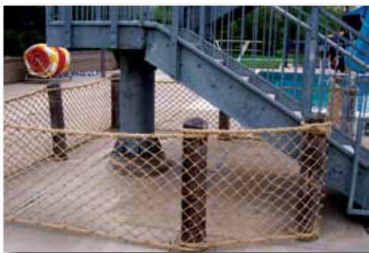
ProManila & P820K