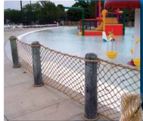
ProManila & P-360K

Creative detailing allows you to build a fence that will meet your desired theme. Our instructions show step by step how easy it is to install a theme fence. Illustrated examples show how to create finishing styles that make a fence uniquely yours.