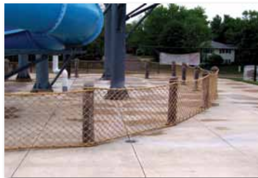
ProManila & P820K