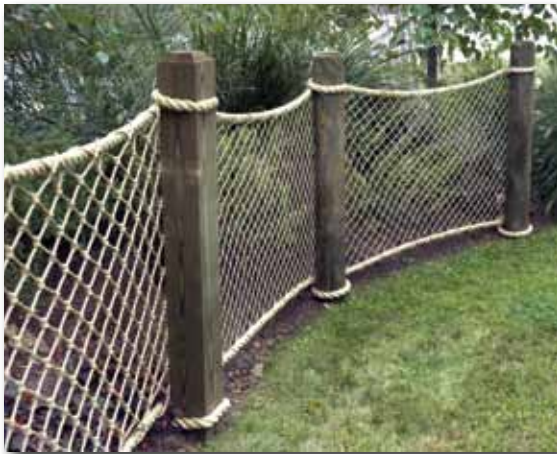
ProManila & P-360K