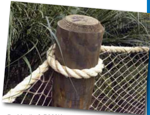
ProManila & P820K