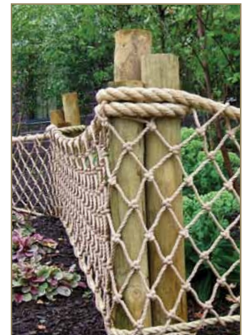
ProManila & P360K