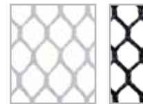
DNR800 / DNR900

Call InCord for all your netting needs at 1-800-596-1066