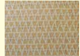
WS85SD 1/16" Knitted Polyethylene Opacity 85 %