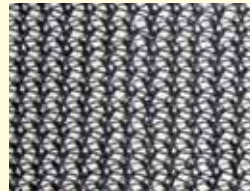
WS70BK 1/8" Knitted Polyethylene Opacity 70 %