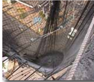
12 cubic feet of concrete caught by safety netting with debris liner.