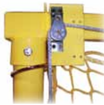
top left corner