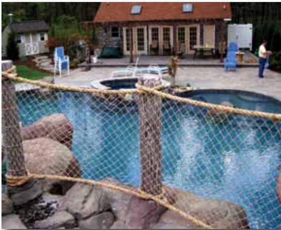
ProManila & P-820K