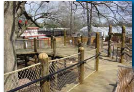
ProManila & P-820K

Our fencing line includes a variety of colors in high tenacity polypropylene netting (HTPP), and solution dyed knotted polyester netting for water parks, theme parks, and zoos. We also offer a variety of ropes (1/4" to 1-1/4") including ProManila®, manila, polyester, and polypropylene. All are long lasting, and all can be exactly fitted to your design.