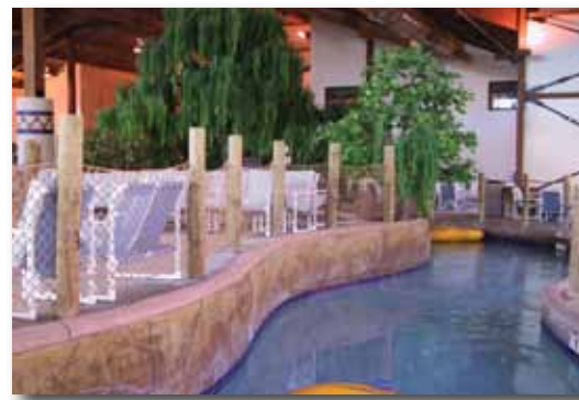
Polyester & P-820K