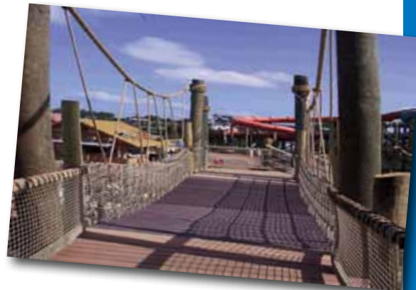
ProManila & M-1250