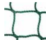
-015 Dark Green